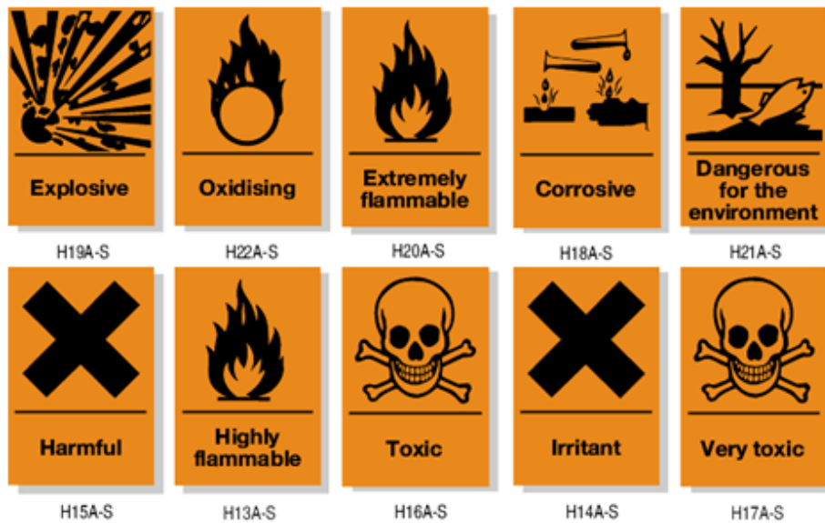
Figure 1: Old chemical hazard symbols.